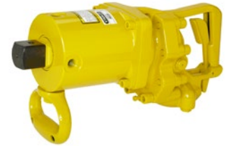
IW24 (NON CE)

The STANLEY IW Series of tools are medium to extreme duty square drive impact wrenches designed for some of the toughest underwater bolting applications. Powered by an integral STANLEY Hyrevz motor, our impact wrenches have an impact intensity ranging from 250 ft lbs of torque to 3,500 ft lbs of torque. Designed to run from a wide range of hydraulic circuits, this wrench allows underwater bolting in the most extreme applications. Hi-visibility yellow paint is standard.