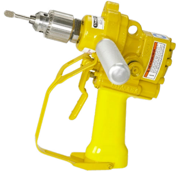
* whips and couplers not included