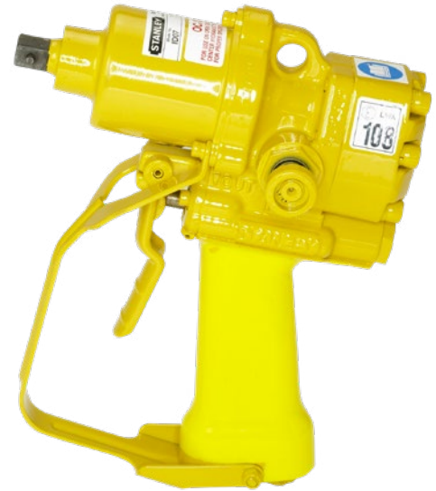
* whips and couplers are included